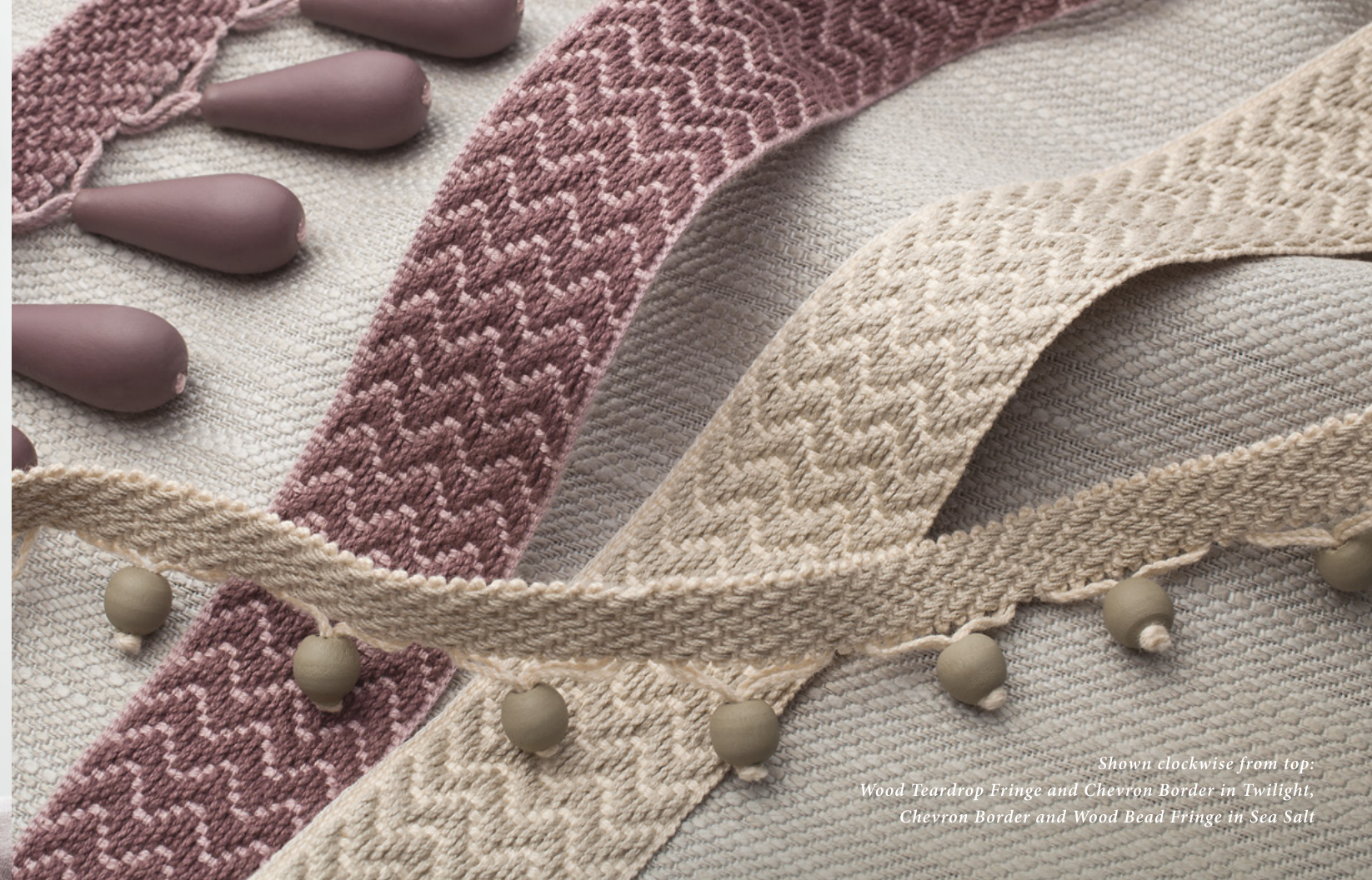
Shown clockwise from top: Wood Teardrop Fringe and Chevron Border in Twilight, Chevron Border and Wood Bead Fringe in Sea Salt

The Seychelles collection was inspired by the natural materials and array of colors found in the untouched paradise of the Indian Ocean archipelago. The color palette is broad, composed of naturally influenced neutrals, midtones and deeper mineral hues offset by a series of brights derived from tropical vegetation.