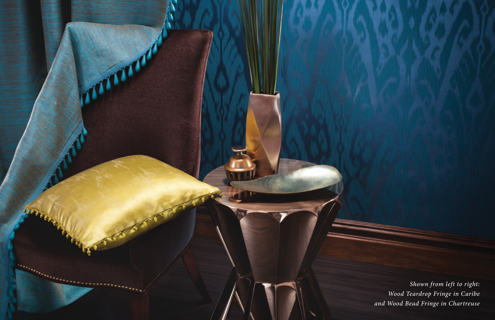
Shown from left to right: Wood Teardrop Fringe in Caribe and Wood Bead Fringe in Chartreuse