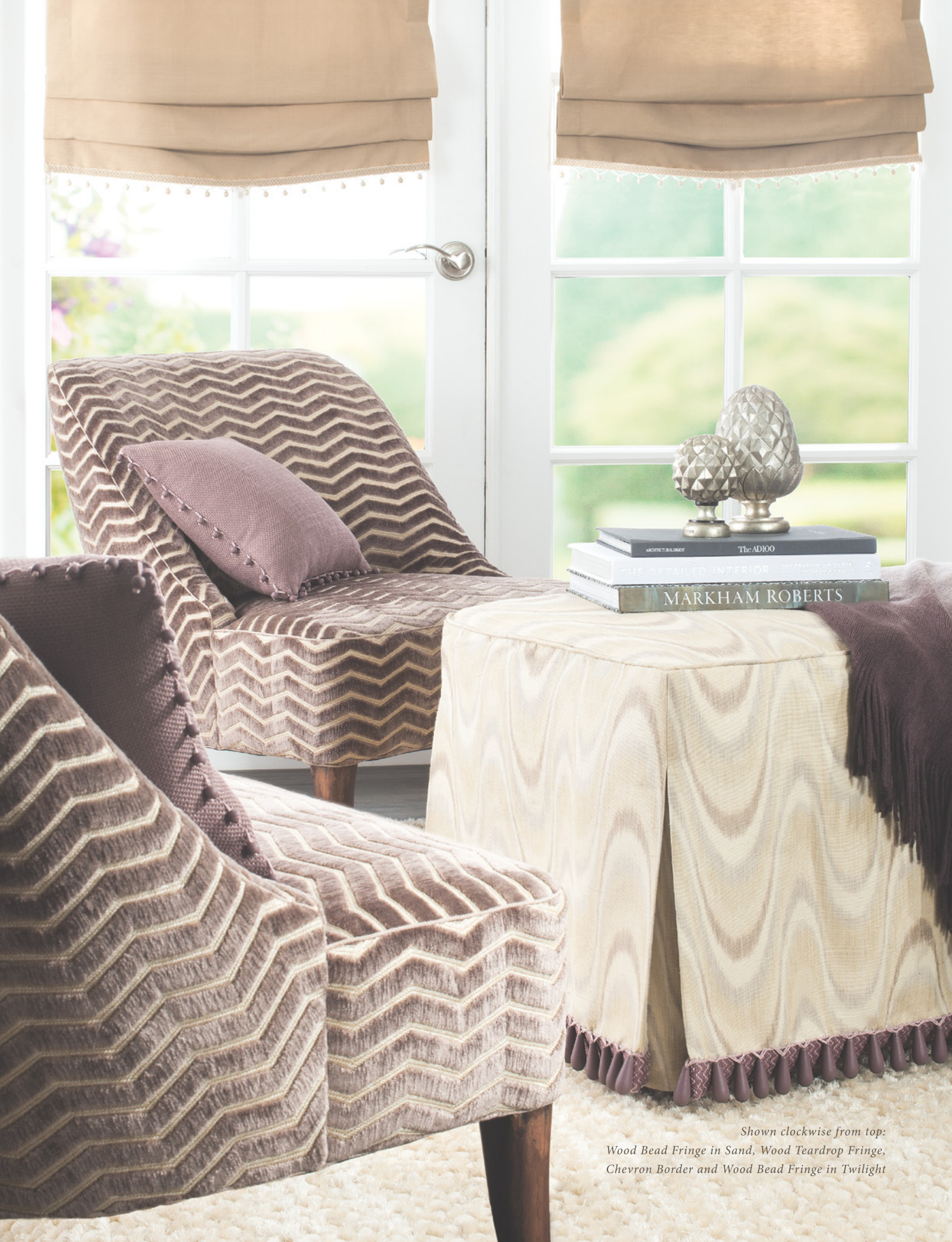
Shown clockwise from top: Wood Bead Fringe in Sand, Wood Teardrop Fringe, Chevron Border and Wood Bead Fringe in Twilight