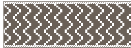
1.5" (40mm) Chevron Border

All styles shown available in: Cloud, Pearl, Sand, Sea Salt, Soleil, Coral, Garnet, Beach Rose, Twilight, Caribe, Cornflower, Navy, Bark, Onyx, Chartreuse, Leaf, Aquamarine